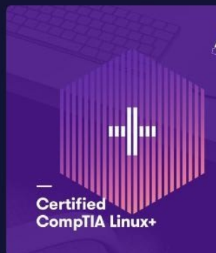
Certified CompTIA Linux+ and LPIC-1: S