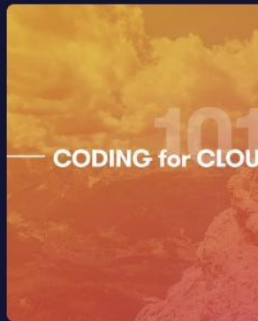
Coding for Cloud 101