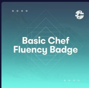
Basic Chef Fluency Badge