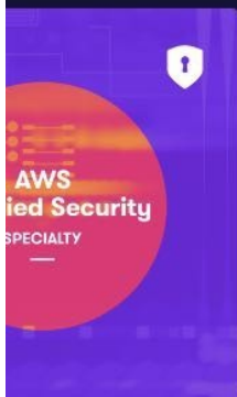
AWS Certified Security Specialty