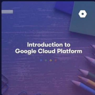
Introduction to Google Cloud Platform