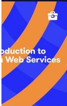
Introduction to AWS